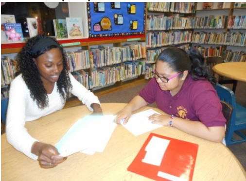
5 th -8 th grade tutoring section.

The 2015 Summer Piano Program was a gala occasion. 47 students came to Edgewater Presbyterian Church twice a week for hour-long piano lessons on Inspired Youth's 9 keyboards. Students were taught by 20 volunteer piano tutors who came from 1-6 hours each week to help students learn to read notes and play the piano. 39 students, ages 4-17, performed solos and duets on the keyboard/piano for the final recital, for a happy audience of 115-120 people.