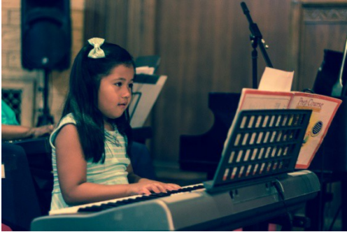
Summer piano recital.

30 years ago the Tutoring Program began assigning children poems to memorize to recite for their parents in the spring Family Night. Every year students memorize poems by Shel Silverstein, Robert Louis Stevenson, Langston Hughes, etc. Besides memorizing their poems, the students often memorize their friends' poems as well. In May/June 2015, 45 students recited poems at Family Night.