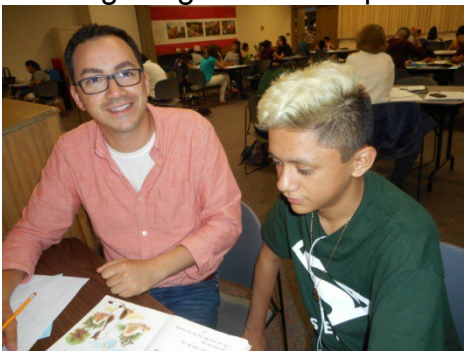
High school tutoring section.