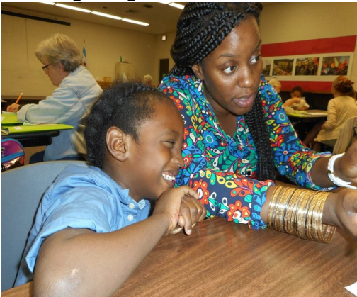
Mother reading to kindergarten son.