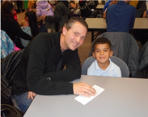
Tutor and student at Family Day.

“Nothing that is worth doing can be achieved in our lifetime; therefore we must be saved by hope. Nothing which is true or beautiful or good makes complete sense in any immediate context of history; therefore we must be saved by faith. Nothing we do, however virtuous, can be accomplished alone; therefore we must be saved by love.” –Reinhold Niebuhr