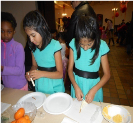
Crafts at Epworth Halloween party.